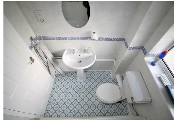
Bathroom 5'7" x 5'10" (1.712 x 1.789)